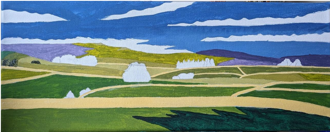
Painted in the walls