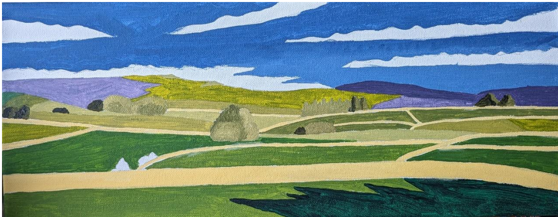
Followed by the trees – can see the need to be darker