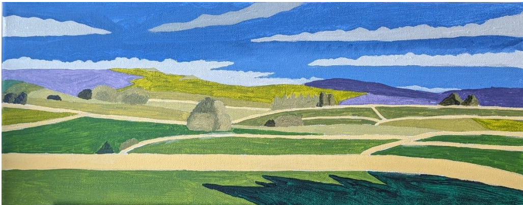
Clouds light to dark greys.